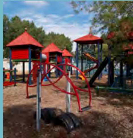
There's always something to keep the kids active and occupied, meaning mum and dad can relax and enjoy the holiday.