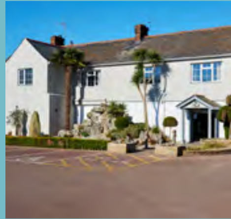
Le Club has been recently refurbished and serves fantastic food, as well as putting on plenty of fantastic events on all season.